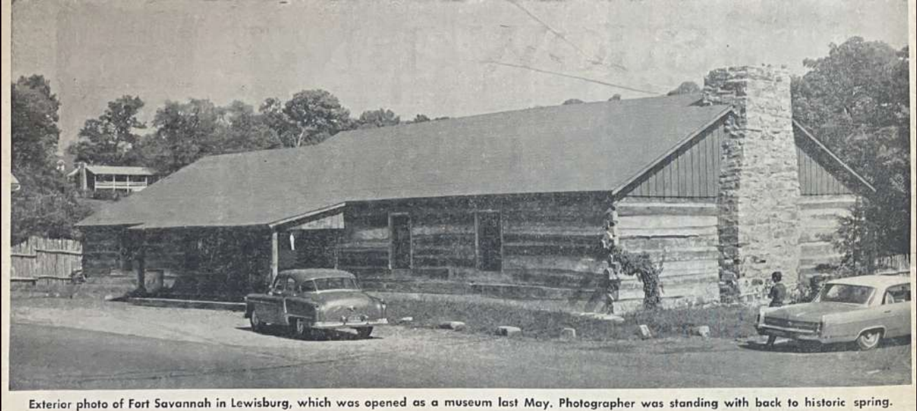
Exterior photo of Fort Savannah in Lewisburg, which was opened as a museum last May. Photographer was standing with back to historic spring.

The formal opening of the Fort Savannah Village Museum and Country Store has been set for May 27 at 8 PM. For the admission fee of $1 one will be entitled to all the cake and ice cream topped with fresh strawberries, he can eat. Of course, he will also have the opportunity to view the museum displays, the country store, and the fine workmanship and artistry which have made this building a thing of beauty and charm. As many as can and will, are invited to come in costumes of the colonial times. Greenbrier Independent vol 98 no. 49