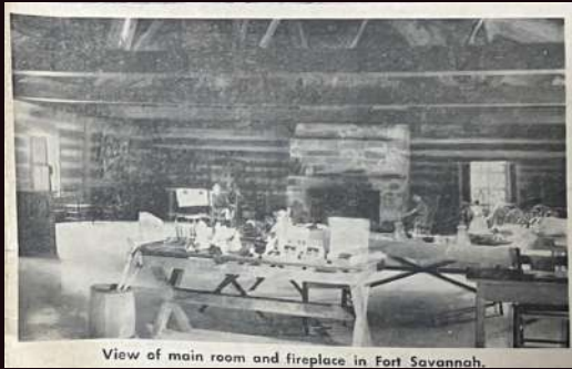
View of main room and fireplace in Fort Savannah.