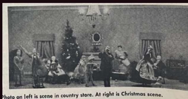
Photo on left is scene in country store. At right is Christmas scene.

Photos published in "A Plain Tale", Charleston Sunday Gazette-Mail September 13, 1964