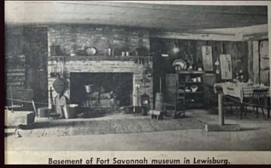
Basement of Fort Savannah museum in Lewisburg.