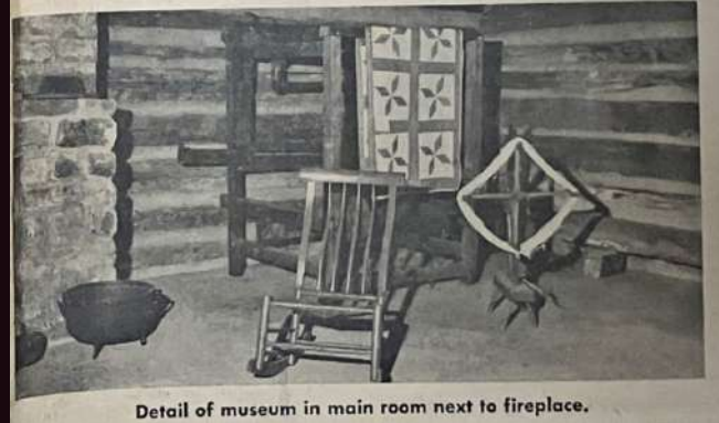
Detail of museum in main room next to fireplace.