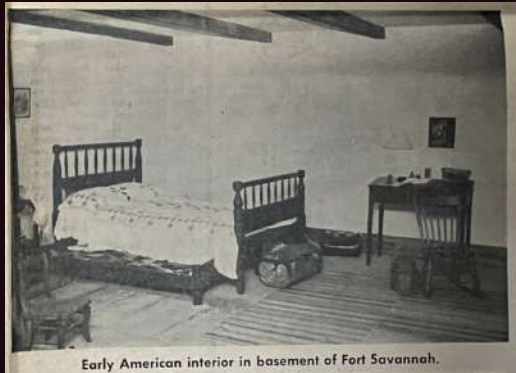
Early American interior in basement of Fort Savannah.